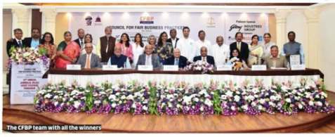
The CFBP team with all the winners

satisfaction, environmental sustainability etc. thereby ensuring that strict standards are adhered to.